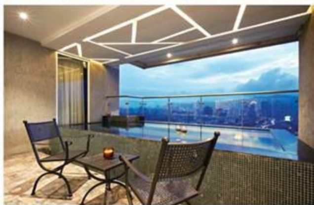
(FACING PAGE) The luxurious and state-of-the-art master bathroom. (TOP) A small pool out on the deck, which is perfect for a relaxing evening.